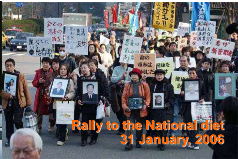
Rally to the National diet 31 January, 2006