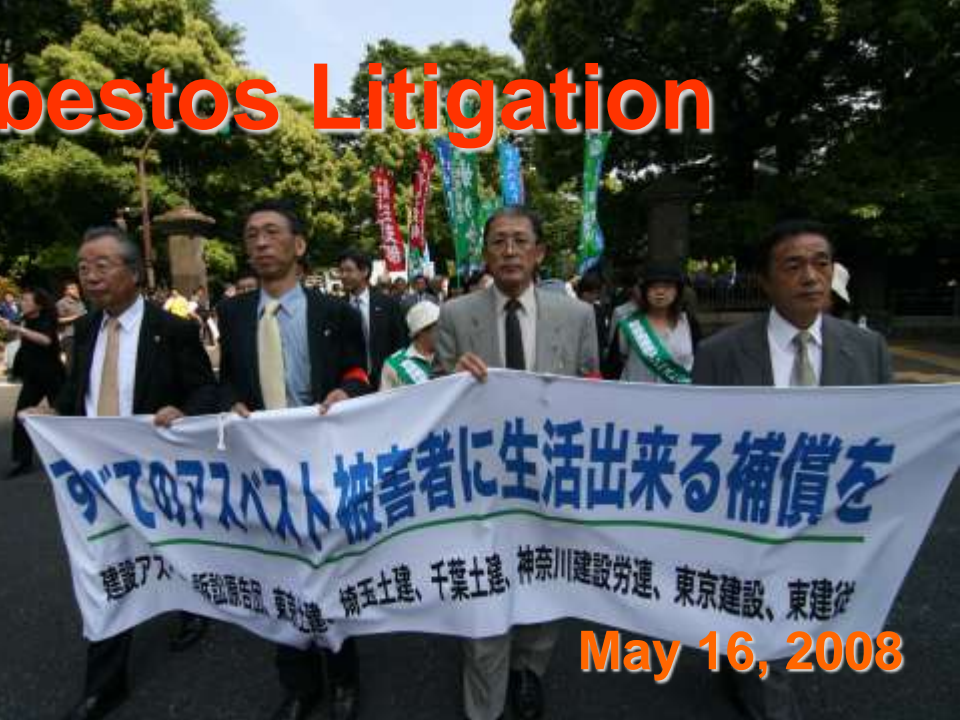
May 16, 2008