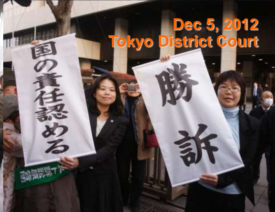
Dec 5, 2012 Tokyo District Court