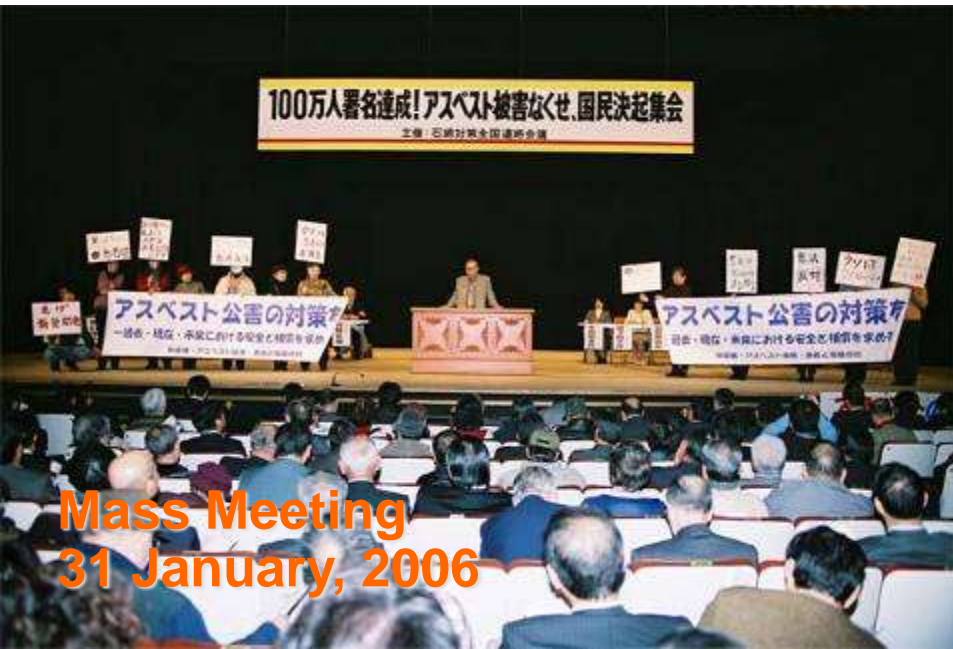
Mass Meeting 31 January, 2006