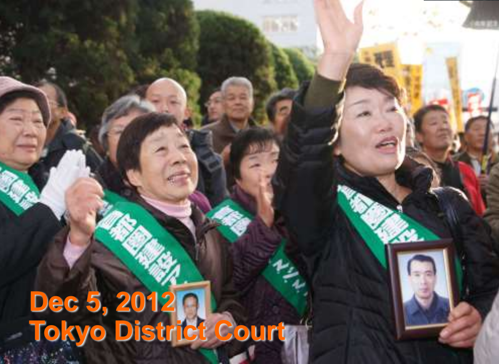
Dec 5, 2012 Tokyo District Court