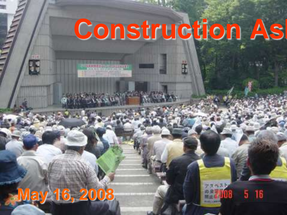
May 16, 2008