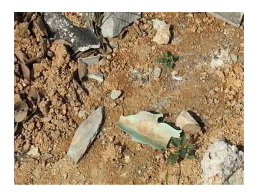
Asbestos fragment was disposed everywhere

The next day when asbestos was exposed in Ma Tong Village, we petitioned to the Environmental Protection Department and met with the officers. We requested the department to dismantle the asbestos in a special process. In order to enhance public's awareness, especially the workers who need to dismantle asbestos buildings, we also requested them to make a general survey and list out all of asbestos buildings. We urged them to start the legislation process of banning all kinds of asbestos as soon as possible.