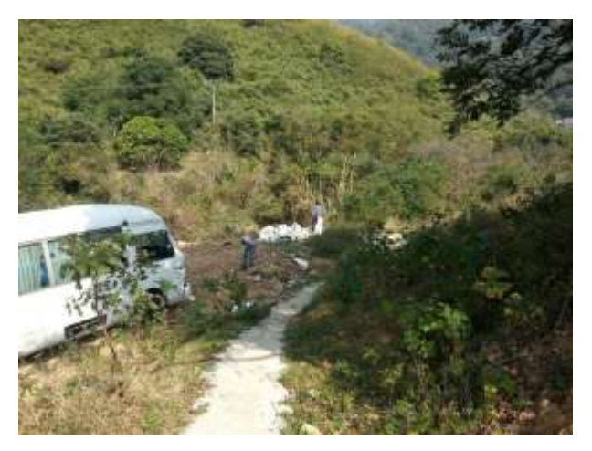
Workers seemed to collect asbestos without any PPE