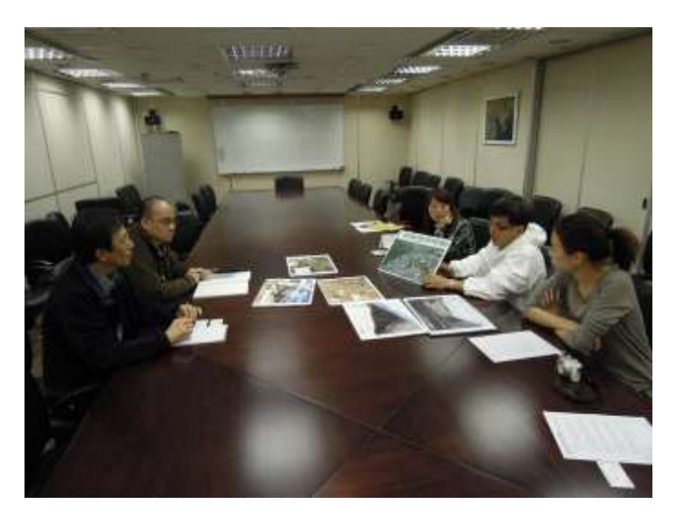
Meeting with the Environmental Protection Department