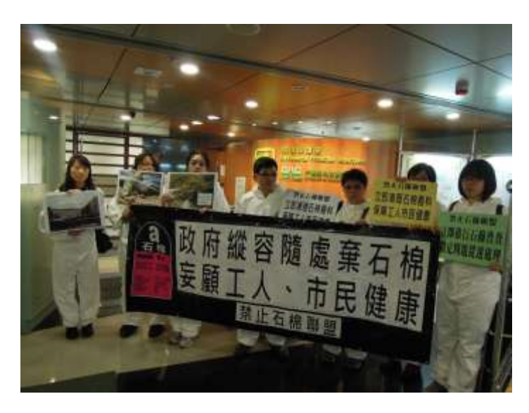
Petitioned to the Environmental Protection Department

The next day when asbestos was exposed in Ma Tong Village, we petitioned to the Environmental Protection Department and met with the officers. We requested the department to dismantle the asbestos in a special process. In order to enhance public's awareness, especially the workers who need to dismantle asbestos buildings, we also requested them to make a general survey and list out all of asbestos buildings. We urged them to start the legislation process of banning all kinds of asbestos as soon as possible.