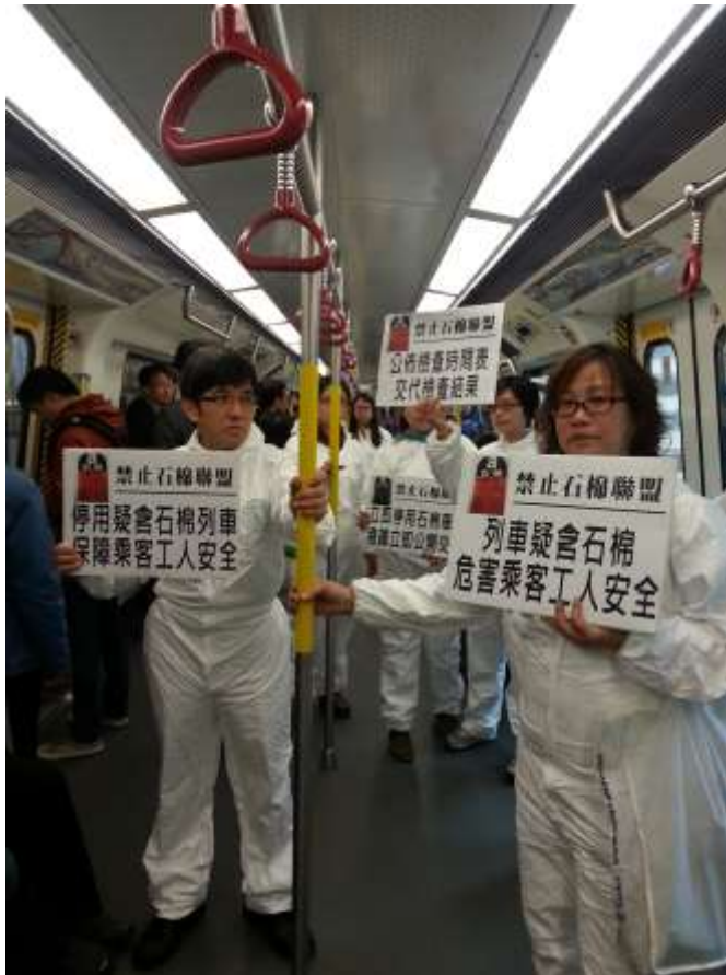
We wear asbestos protection clothes, heave cards in the carriage