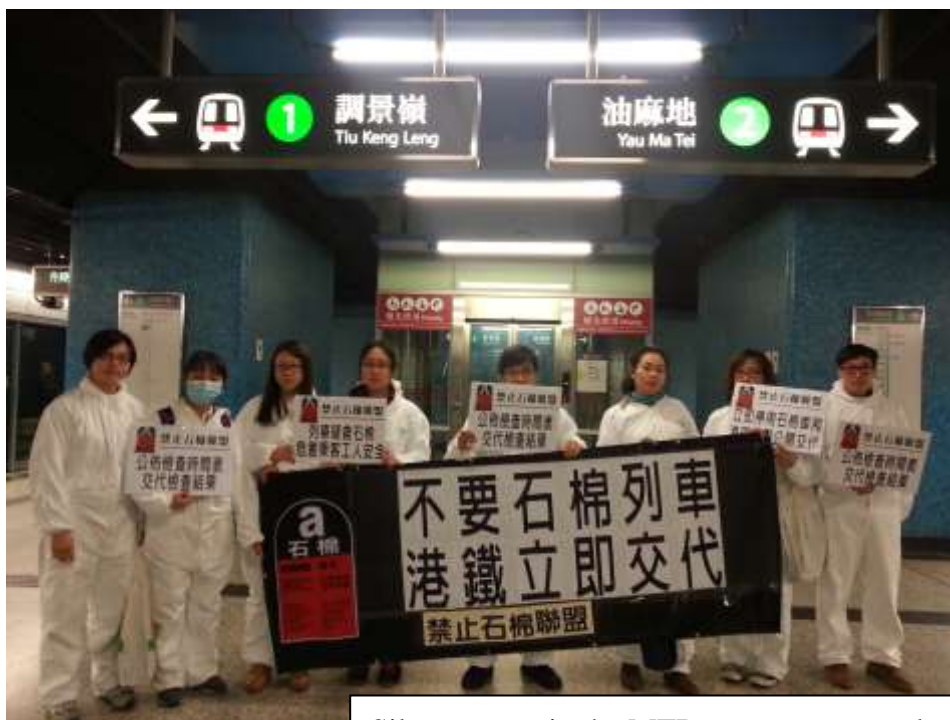
Silent protest in the MTR carriages, started from Lam Tin MTR station