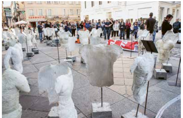
Opening of the exhibition “100 asbestos dead” in the Piazza Riforma in Lugano on 28 April 2010.

The problem of the statutory limitation of legal claims has not been resolved and not all workers who are sick as a result of exposure to asbestos know that they have an entitlement to insurance benefits – above all migrants who have become sick after returning to their countries of origin. However, the engagement of trade unions and asbestos victim associations have achieved successes here: the statutory period of limitation for bodily injury was