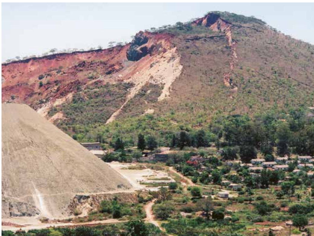
Asbestos mine in Mashaba in Zimbabwe.