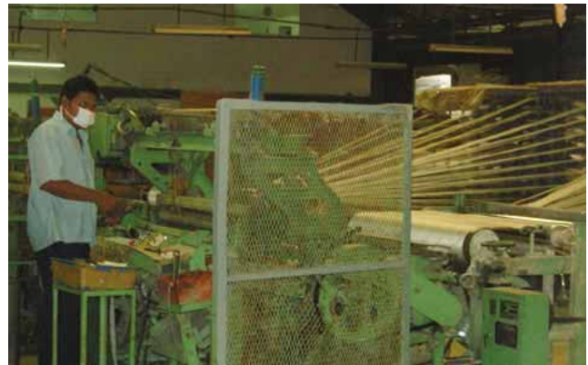
Asbestos textile production at PT Jeil Fajar factory

about the local asbestos textile factories and nothing about asbestos-related diseases;