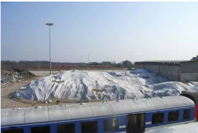
The contaminated dump is first sealed.

Given the widespread usage of asbestos in transportation infrastructure, the contamination of older European railway vehicles is a common occurrence. How countries which have banned asbestos deal with this contamination highlights the existence of accepted clean-up measures which minimize occupational hazards. In his presentation, Heinz