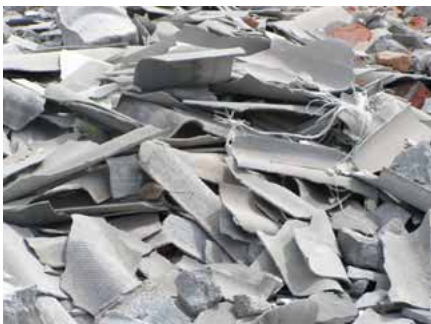
Easily identified asbestos debris at Aceh.