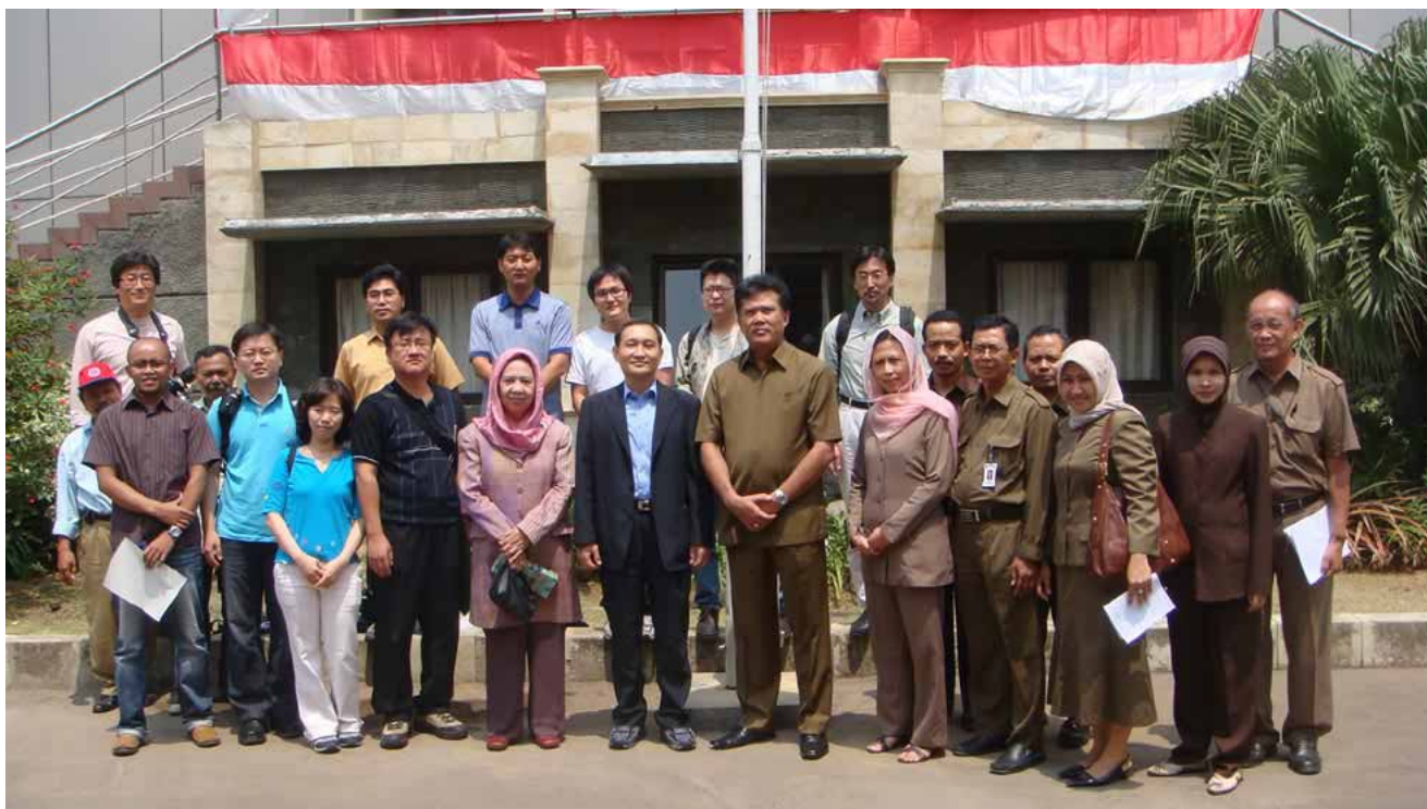
Joint research team, Indonesia, August 2008