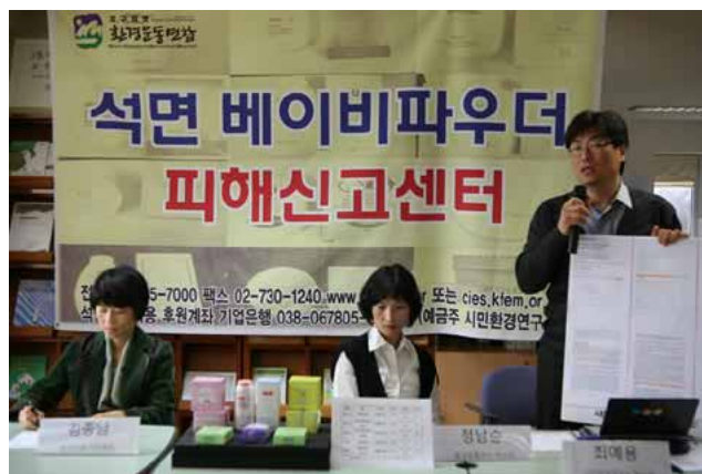
Launch of "baby powder hotline" by KFEM