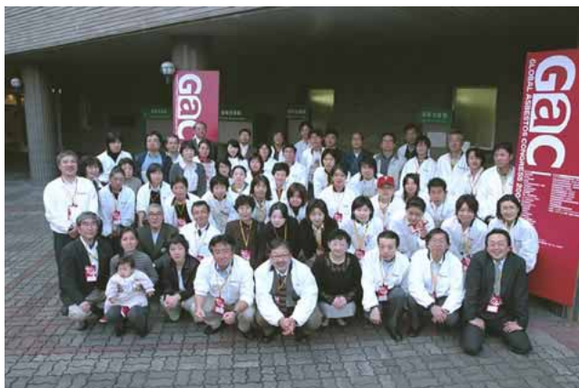
GAC 2004: the highly effective support team

As the campaign became a global phenomenon, it became clear that a permanent body was needed to service the needs of the movement; the International Ban Asbestos Sec-