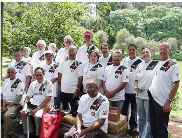
Sunday in the park with ABREA

In recent years, asbestos bans had been achieved in Argentina, Chile, Uruguay, four Brazilian states and several Brazilian municipalities. In many South American countries, victims’ groups such as the Brazilian Association of the Asbestos-Exposed (ABREA) had played a prominent role in formulating national asbestos debates by positioning themselves as counterpowers to the industrial might of asbestos stakeholders [98]. Since it was founded in 1995,