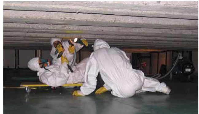
Cramped working conditions

Throughout the asbestos removal, air monitoring was carried out on the passenger platforms of the subway station as well as in the working zone above. The use of scores of photographs by the speaker illustrated the difficulties posed by this project and the technical solutions which