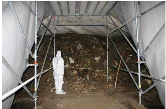
Access tunnel for clearance of contaminated waste.

Kropiunik quantified the problem in Austria, showed photographs of faulty working practices and explained a decontamination program which safely removed huge quantities of asbestos-containing material (ACM) from hundreds of Austrian rail vehicles. According to available estimates, a typical Austrian rail vehicle built during the 1960s-1970s could contain between 40 and 80 kilograms of ACMs; these products were used for acoustic, thermal and electrical insulation and fireproofing. Common ACMs in railway vehicles included sprayed-on asbestos insulation, which was extremely friable and had a high asbestos content, panels, ropes and boards.