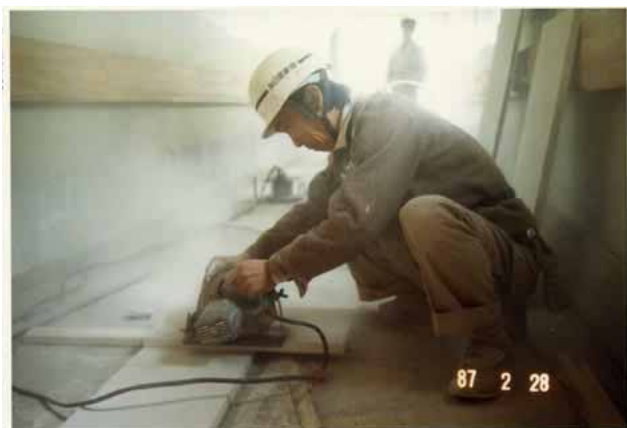
Cutting operations resulted in exposures as high as 787 fibers/ml. Here, the level was 131 fibers/ml

ernment for mesothelioma and lung cancer, of which 1,387 (41%) worked in construction [36]; the second highest group affected were workers in shipbuilding who accounted for a total of 444 cases (13%).