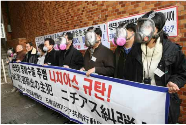
BANKO members demonstrate with BANJAN outside Nichias premises at Oji, Japan.

tected the presence of crocidolite (blue) asbestos; subsequent measurements taken by the Ministry of Labor verified these findings. Samsung denied the contamination;