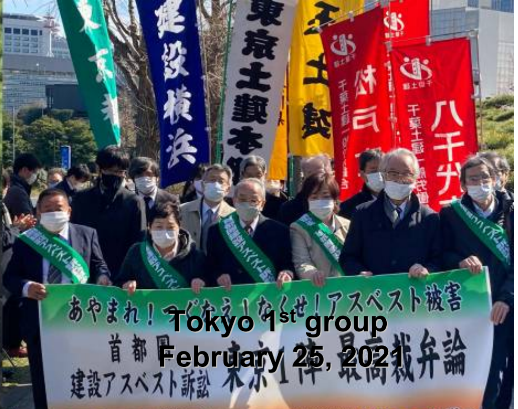
あやまれ! つぐなえ! なくせ! アスベスト被害 Tokyo 1st group 最高裁弁論 February 25, 2021 建設アスベスト訴訟 東京1陣