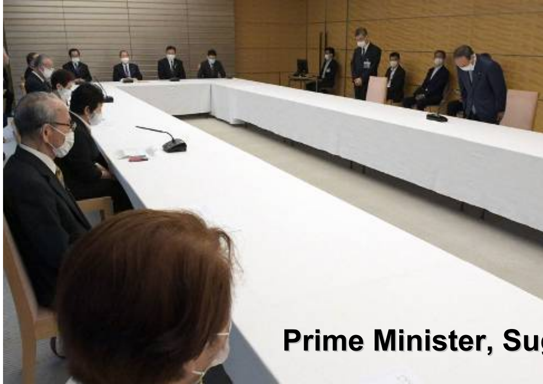
Prime Minister, Suga.