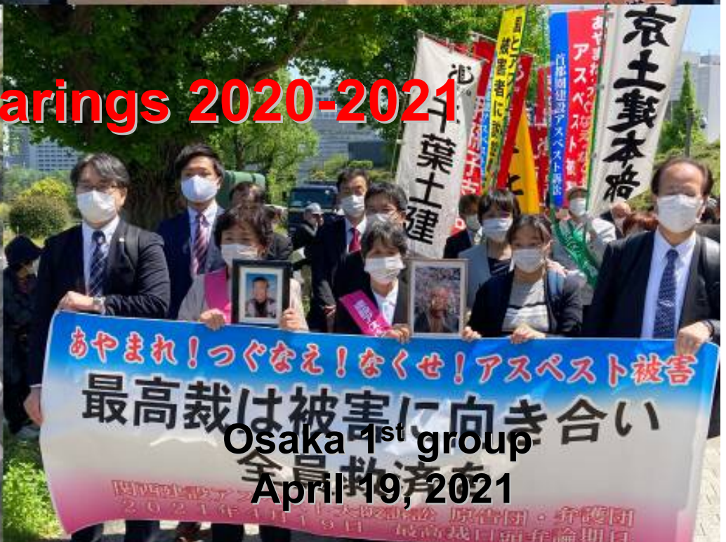
あやまれ! つぐなえ! なくせ! アスベスト被害 Osaka 1st group 最高裁は被害に向き合い 全面救済を April 19, 2021