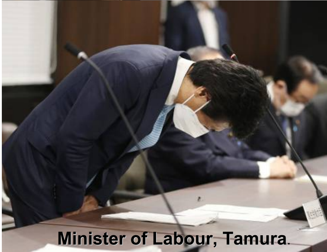
Minister of Labour, Tamura.