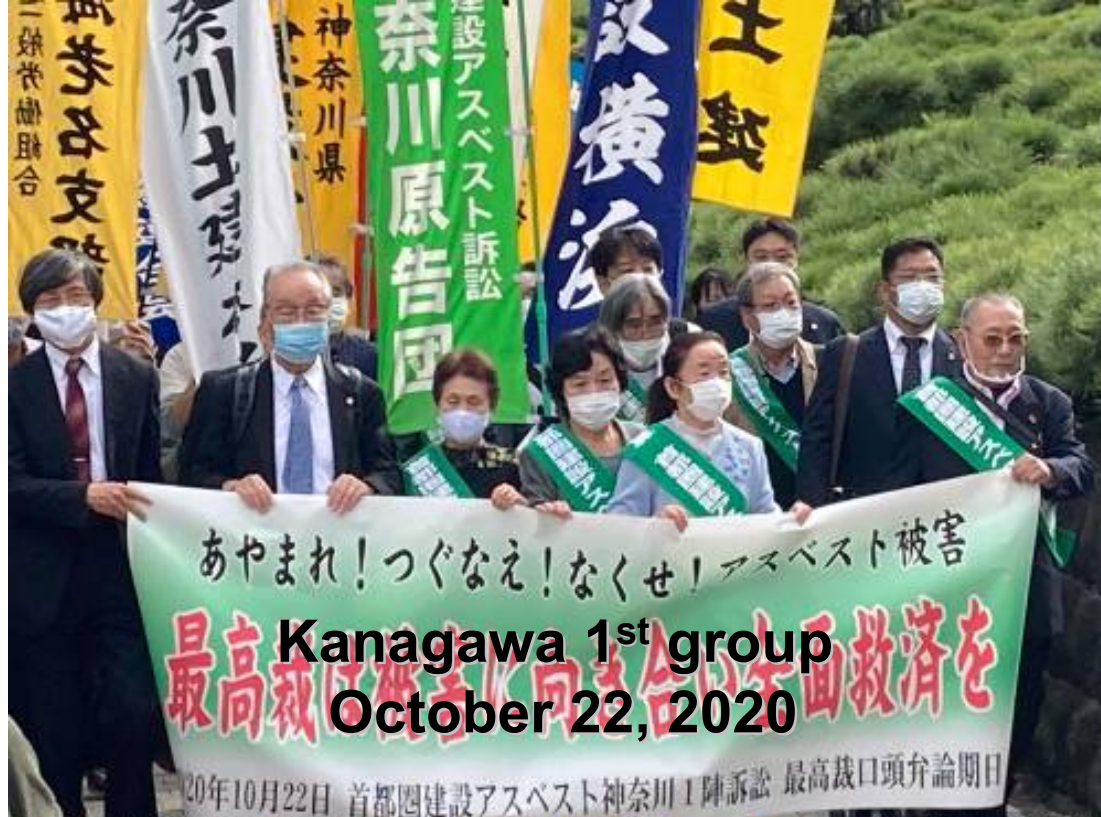
あやまれ! つぐなえ! なくせ! アスベスト被害 Kanagawa 1st group 最高裁は被害に向き合い 全面救済を October 22, 2020 20年10月22日 首都圏建設アスベスト神奈川1陣訴訟 最高裁口頭弁論期日