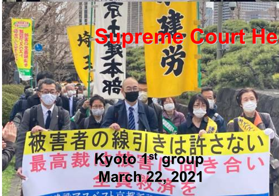
被害者の線引きは許さない Kyoto 1st group 最高裁は被害に向き合い 全面救済を March 22, 2021